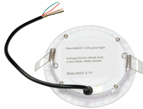
Spring Clips for Easy Installation