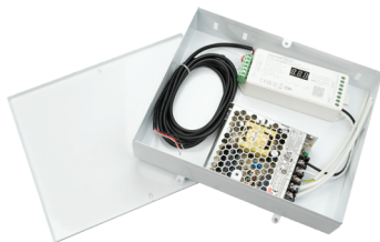
Decoder/Driver Combination Accessory Includes J-Box (D-JB)